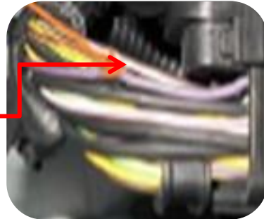
CHMSL (Purple / Grey shown)