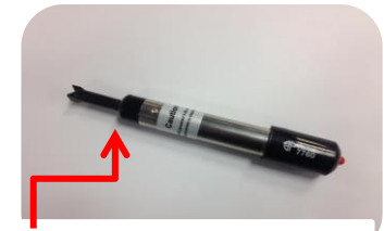
Computer safe tester

All wires should be tested prior to final hook up. Test the lock wire first then the unlock wire by using computer safe tester. The new Chevy have low voltage going through the wires. The old tester will not work. Stander tester will not work.