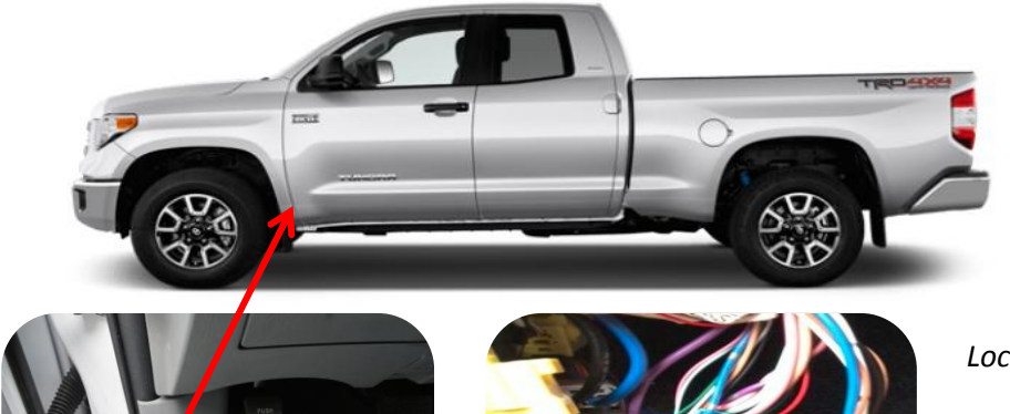
Lock (White/Grey shown)